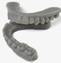
9 min 11 Clear Aligner Models