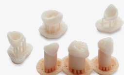
18 min Over 100 crowns

Dentistry made easier through innovative solutions.