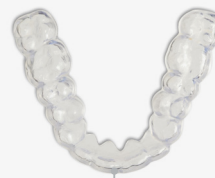
49 min 8 Splints