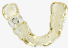
48 min 8 Surgical Guides

Unprecedented print speeds. Print a dental model every 49 seconds.